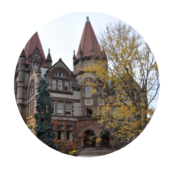
University of Toronto St. George